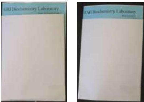
Must be in separate sample bags

Samples for different sites must be in separate sample bags: