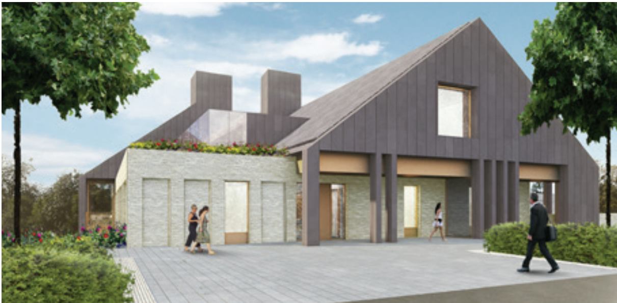
Artists impression of the new Hospice front entrance

The new facility will be located within the grounds of Bellahouston Park. It is the first of its kind in the UK and will revolutionise the delivery of palliative care as we know it. It will also reduce the age range to 15 years and over and bridge the gap in the provision of care that currently exists for young people suffering from a terminal or life limiting illness.