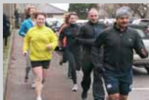
Above: Staff jogging on the Gartnavel site