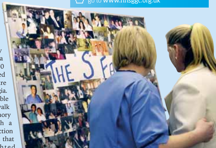
Pictures show the personal celebrations of staff at the hospital over the years

Staff were able to take a walk down memory lane with a large selection of photos that highlighted momentous