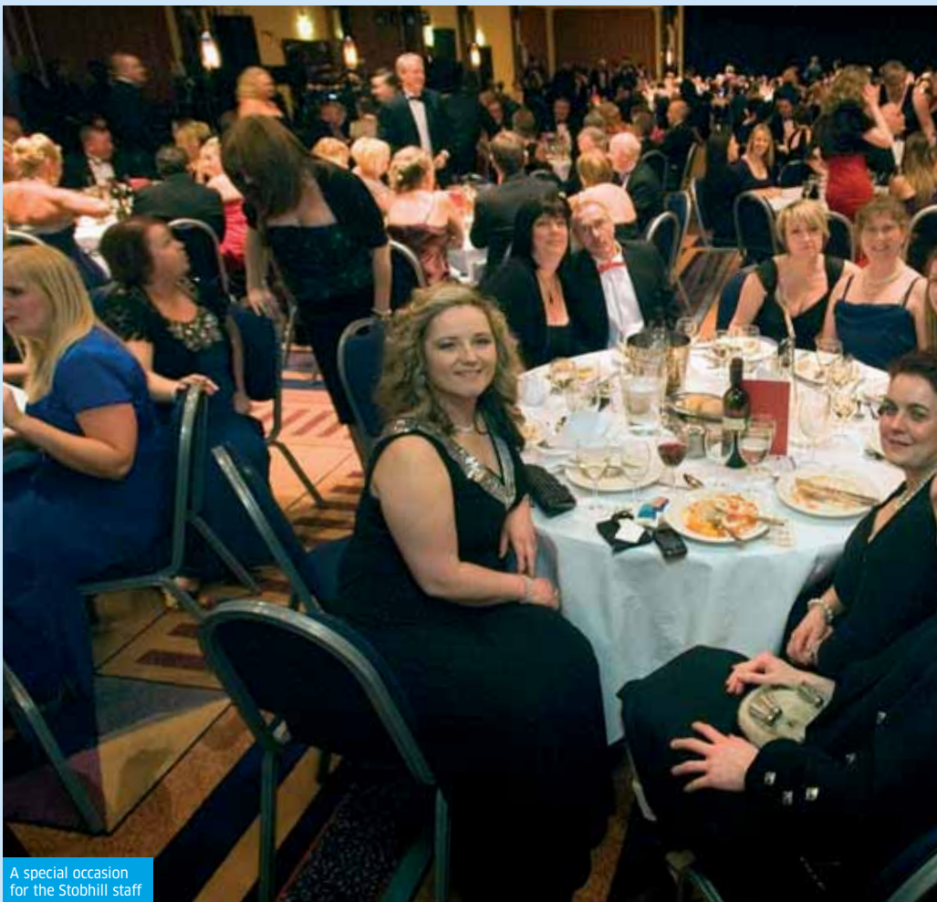
A special occasion for the Stobhill staff

During the First World War, the hospital was