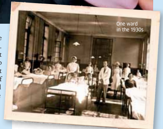
One ward in the 1930s