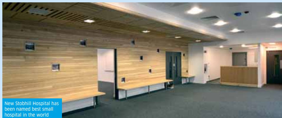
New Stobhill Hospital has been named best small hospital in the world

From the late 1920s, Stobhill was to steadily grow into a modern hospital with a number of new developments, including a much-