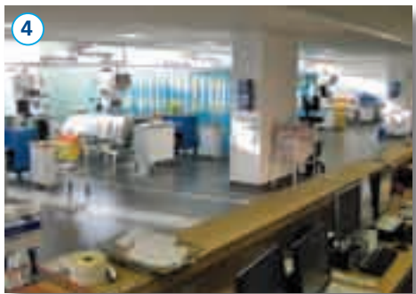
4 ITU within the Queen Elizabeth Building