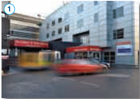
1 Entrance to A&E within the Jubilee Building