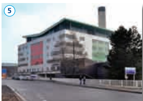
5 Public Entrance to Princess Royal Maternity