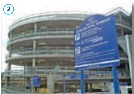
2 Multi-storey Car Park