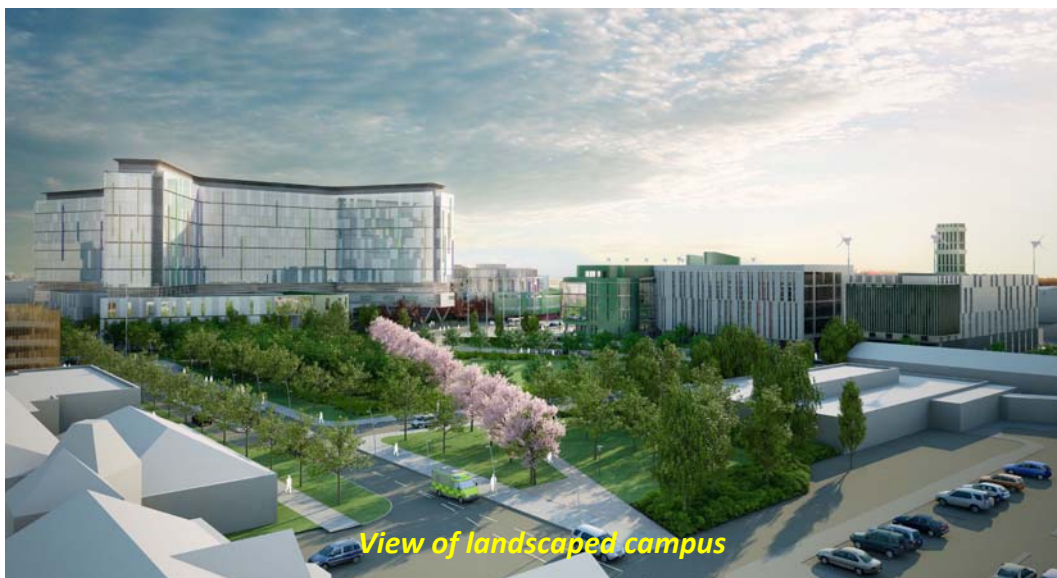
View of landscaped campus