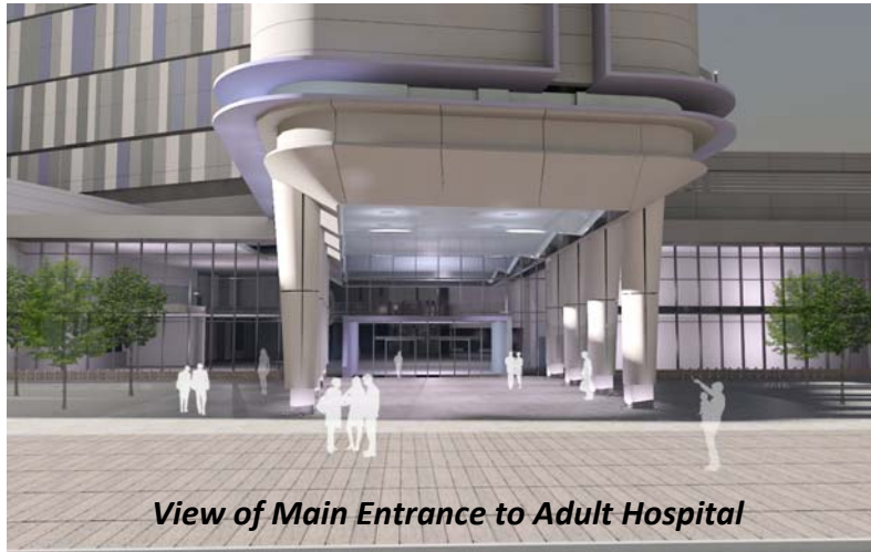
View of Main Entrance to Adult Hospital

The atrium of the new hospital will house retail shops and a coffee shop. There will also be a large restaurant/coffee area on the first floor of the hospital with a balcony and views out onto the landscaped area in front of the hospital.