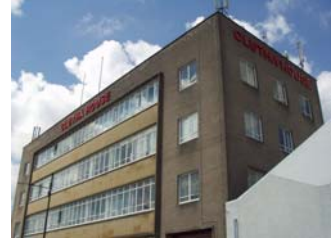
The Dental Directorate Clutha House 120 Cornwall Street South Kinning Park, Glasgow