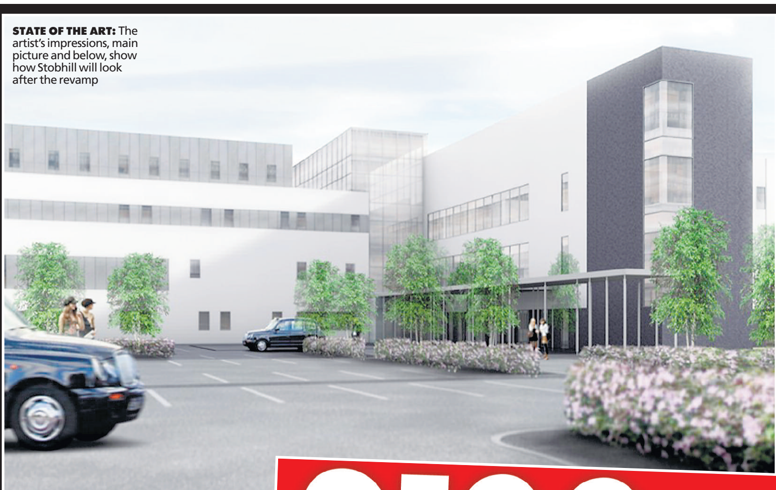
STATE OF THE ART: The artist's impressions, main picture and below, show how Stobhill will look after the revamp

The alarm was raised last night when they failed to turn up at a pre-arranged point. Conditions today are described as "dreadful", with winds of up to 70mph.